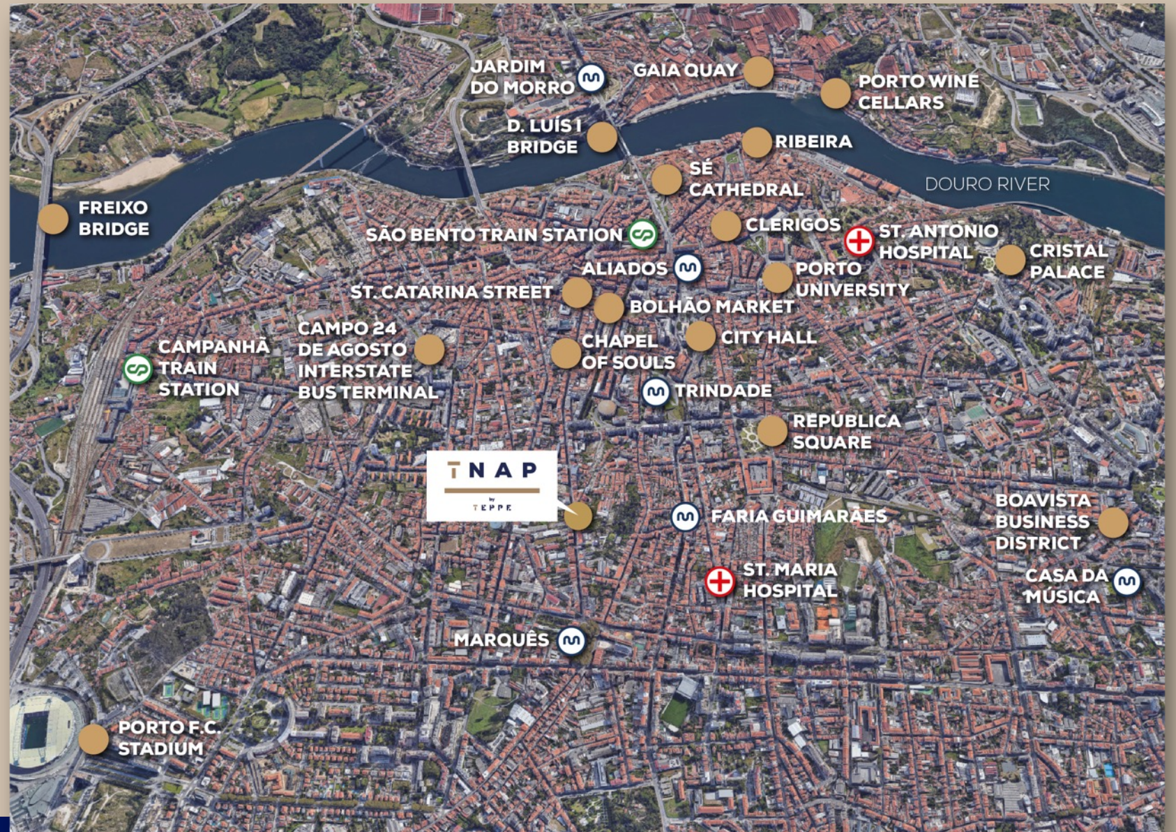
Porto , Portugal

Located in Santa Catarina Street, the major shopping district of Porto, Tnap is at walking distance from Porto City Hall and Aliados Avenue, as well as from Bolhão Market or Chapel of Souls.